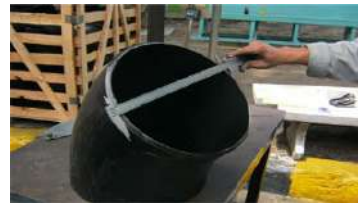
Testing and Inspection