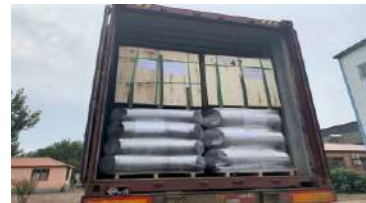
Packing and Dispatch