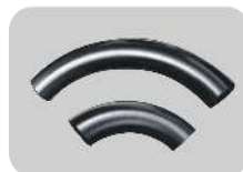
L R BENDS